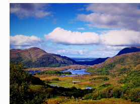
Looking north towards the lower lake and Killarney

South and west of Killarney in Co. Kerry is an expanse of rugged mountainous country. The McGillicuddy's Reeks, the highest mountain range in Ireland, rise to a height of over 1000m. At the foot of these mountains nestle the world famous lakes of Killarney. Here where the mountains sweep down to the lake shores, their lower slopes covered in woodlands, lies the 26,000 acre Killarney National Park. The distinctive combination of mountains, lakes, woods and waterfalls under ever changing skies gives the area a special scenic beauty.