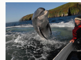
The famous Dingle Dolphin "Fungie" is a must see visit.

There are many and varied things to do: water sports, hiking, walking, team building, cycling, nature trails, sailing, visits to ancient sites and of course the famous Ring of Kerry Coach Tour. Probably more than you'll fit into your programme. If you have specific requirements and wish to be guided as to what is available please contact the Tourist Centre on Beech Road, Killarney, Kerry, +353 (0)64 6631633, killarneytio@failteireland.ie .