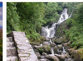
Torc Waterfall from the viewing point