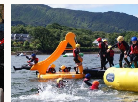
Star Outdoors Water Sports Centre in Kenmare