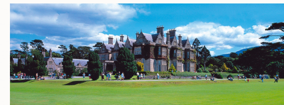
Muckross House and Gardens, are immediately accessible on entrance to the National Park, near the Venture Centre.